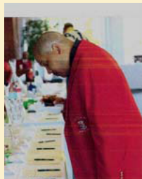
Guests look over the many items displayed at the Silent Auction.