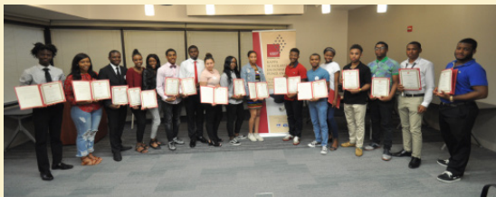
2018 KSEF Scholarship Recipients