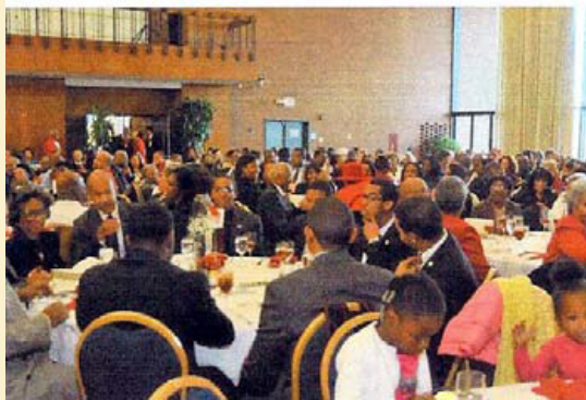
Guests participating in the festive action of the Live Auction.

The Celebrity Auction and Soul Food Feast is held annually in the Fall on the campus of Howard University. It is our major fundraising event. More than 700 supporters attend this event annually and it has been sold out for 34 years. Through the generosity of many individuals and businesses that contribute gifts and services for the Live and Silent Auctions, KSEF raises funds to support this scholarship program.